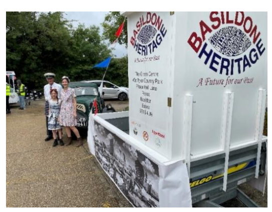
Our float with our volunteers dressed in 1950 outfits

We entered the parade for the second year – this year we had several of our volunteers dressed in 1950s outfits. The parade started from De La Salle school and ending in Northlands Park, where we had set up our display gazebo. The parade took over an hour and a half, but was well worth it. Weather held